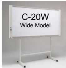
C-20W Wide Model