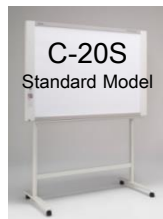
C-20S Standard Model